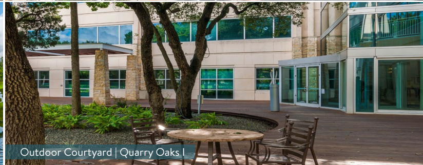
Outdoor Courtyard | Quarry Oaks I